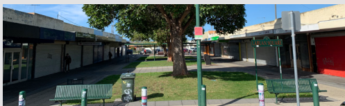
Labuan Square, Norlane

10 Public Seats 3 Bike Racks 3 Rubbish Bins 2 Bus Stops Nearby (1 Sheltered) Partly Sheltered Public Square Public Toilet Facilities 3 Grassed Areas 6 Established Trees Street Wall Art in several locations Public Artwork on Bollards & Pavers Norman Lane Heritage Walk Marker Labuan Square Urban Renewal Project earmarked for 2020-2021