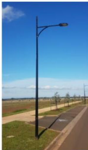
Decorative - Manningham