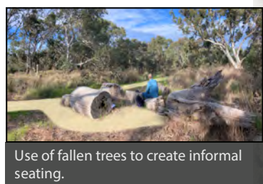
Use of fallen trees to create informal seating.