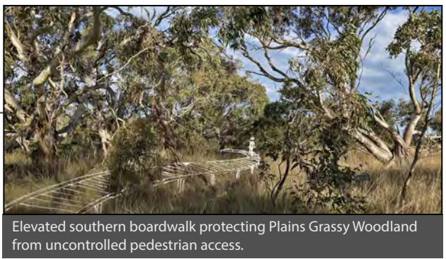
Elevated southern boardwalk protecting Plains Grassy Woodland from uncontrolled pedestrian access.