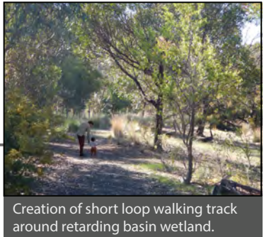
Creation of short loop walking track around retaining basin wetland.