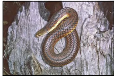
Woodland & grassland ecology provides habitat for snakes & reptiles.