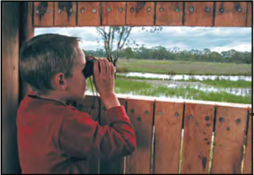
Bird hide to provide secluded views to Plains Freshwater Sedge Wetland & mature redgum habitat.