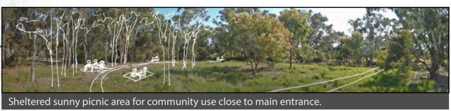
Sheltered sunny picnic area for community use close to main entrance.