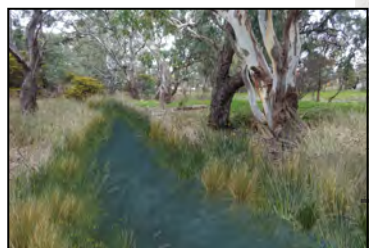
Improve long term health of redgums by enhancing waterflow into creek.