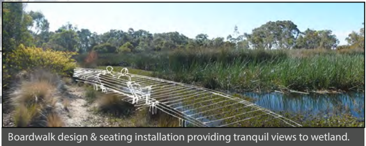
Boardwalk design & seating installation providing tranquil views to wetland.