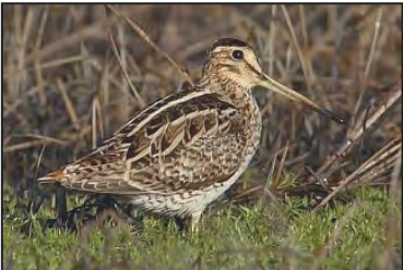
Plains freshwater sedge wetland providing critical habitat for the endangered Latham's Snipe & frogs.