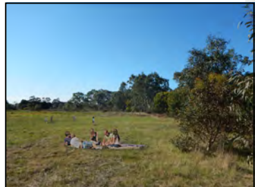
Grassy open space for informal recreation.