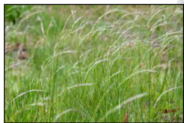
Ongoing protection & enhancement of remnant microlaena grassland habitat.