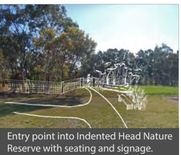
Entry point into Indented Head Nature Reserve with seating and signage.