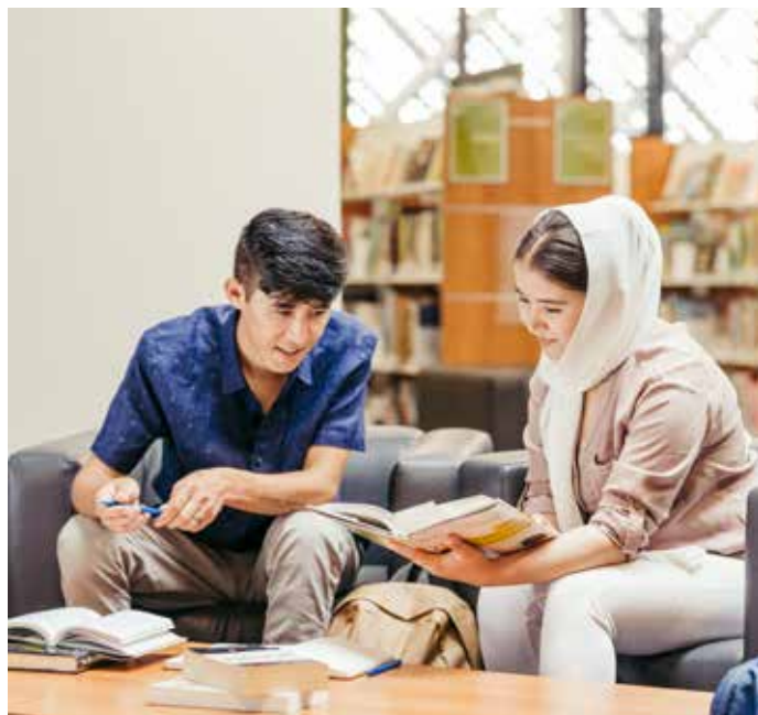
Pictured above: Young people studying together at the library

Our councillors and leaders will make sure social equity is part of all decisions about services, places, spending, and planning.