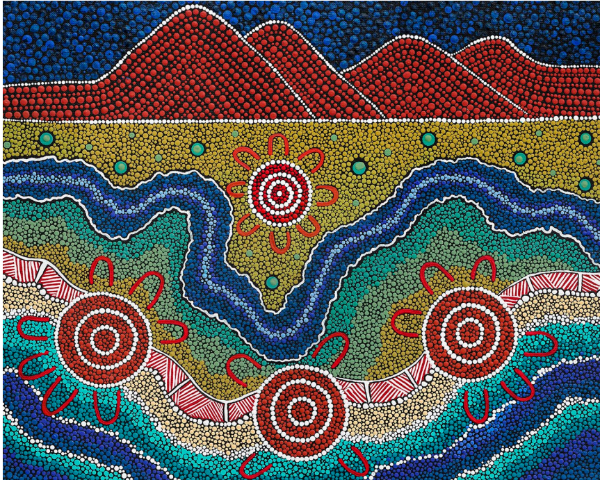
Artwork: On Country by Ammie Howell.

The City of Greater Geelong acknowledges Wadawurrung people as the Traditional Owners of this land. It also acknowledges all other Aboriginal and Torres Strait Islander People who are part of the Greater Geelong community today.