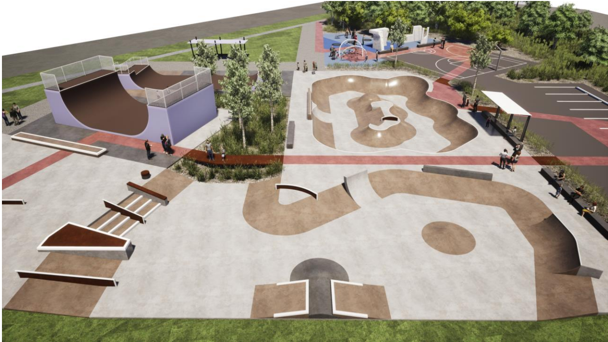
Figure 1 - Waurn Ponds Skatepark concept plan