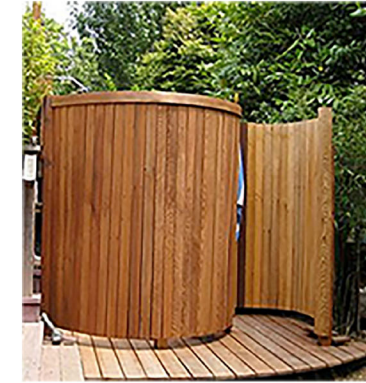
Changerooms, showers and toilets