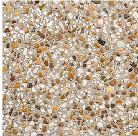
Exposed aggregate concrete