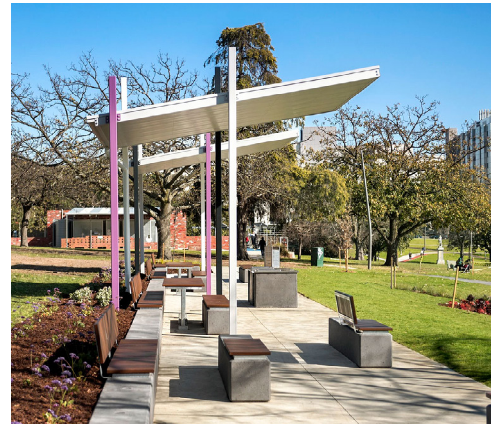
Sheltered Seating Area