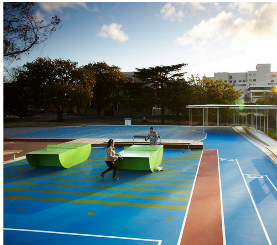
Play Linemarking & Additional Sports Equipment