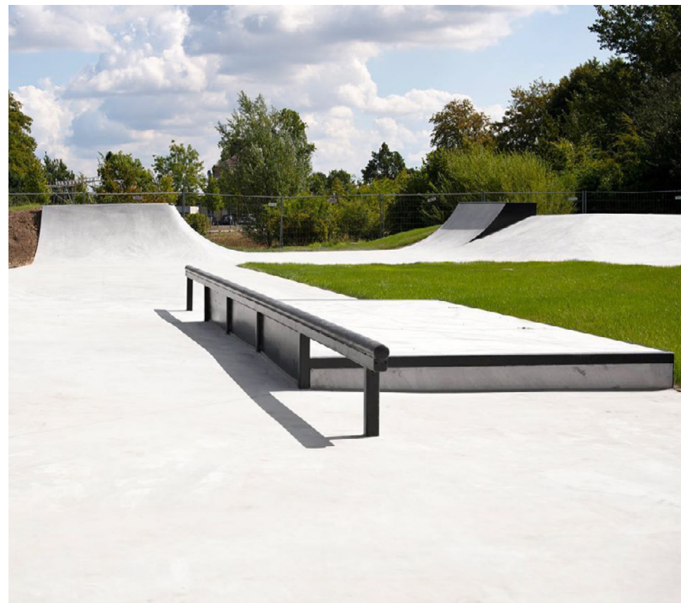
Skate - Blocks & Rails