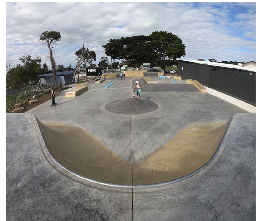
Skate - Transitioned Pocket & Hips