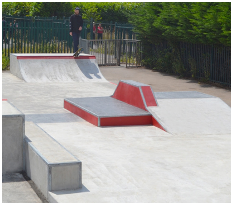
Skate - Low-Level Banks & Transitions